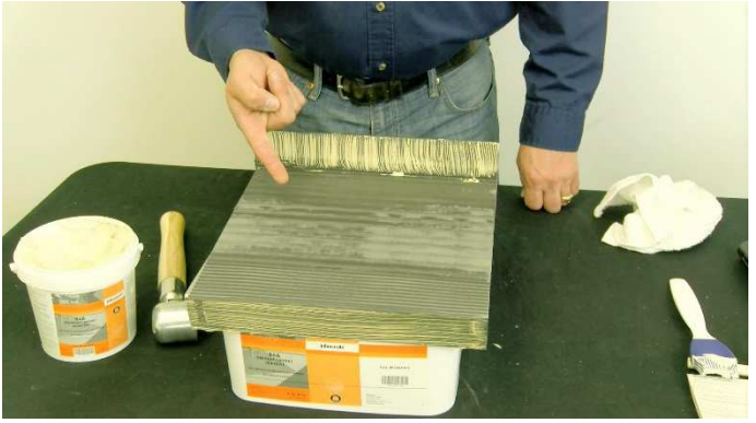
Give the adhesive a light touch. When there is no transfer to the fingers, the adhesive is ready. You have two hours of working time, once the adhesive reaches the dry to the touch state.