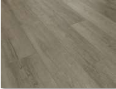
CWH-1554 /Santa Fe