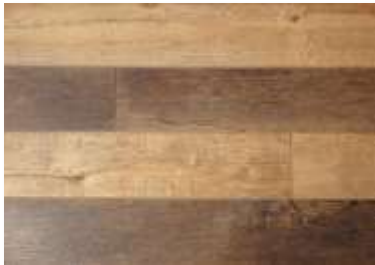
CW-2530 /Roasted Honey