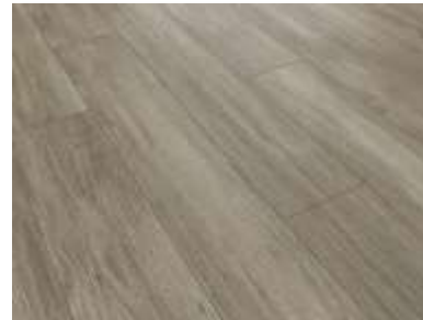
CWH-1677 /Bar Harbor