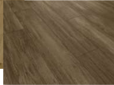
CWH-1675 /Couer d'Alene