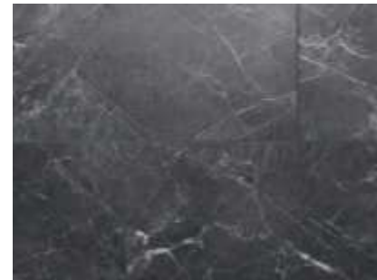
XT-4201 /Bella Nero

Audacity ® The Fearless Waterproof Hybrid Rigid Core