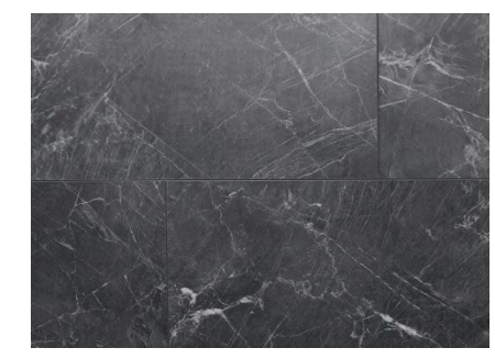
XT-4201 /Bella Nero