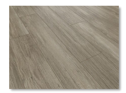
CWH-1677 /Bar Harbor