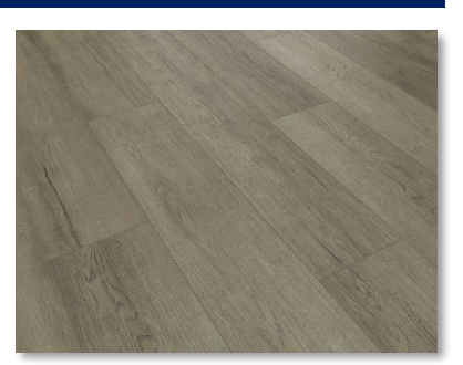
CWH-1554 /Santa Fe